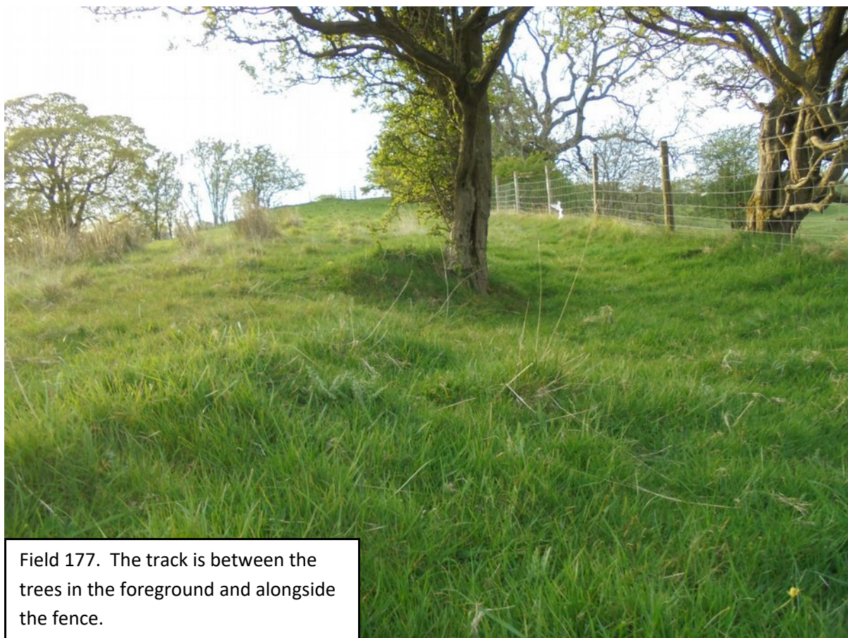
Field 177. The track is between the trees in the foreground and alongside the fence.