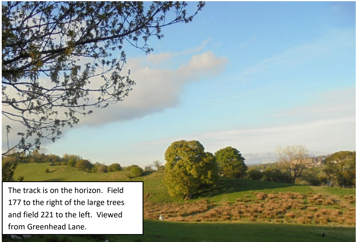
The track is on the horizon. Field 177 to the right of the large trees and field 221 to the left. Viewed from Greenhead Lane.