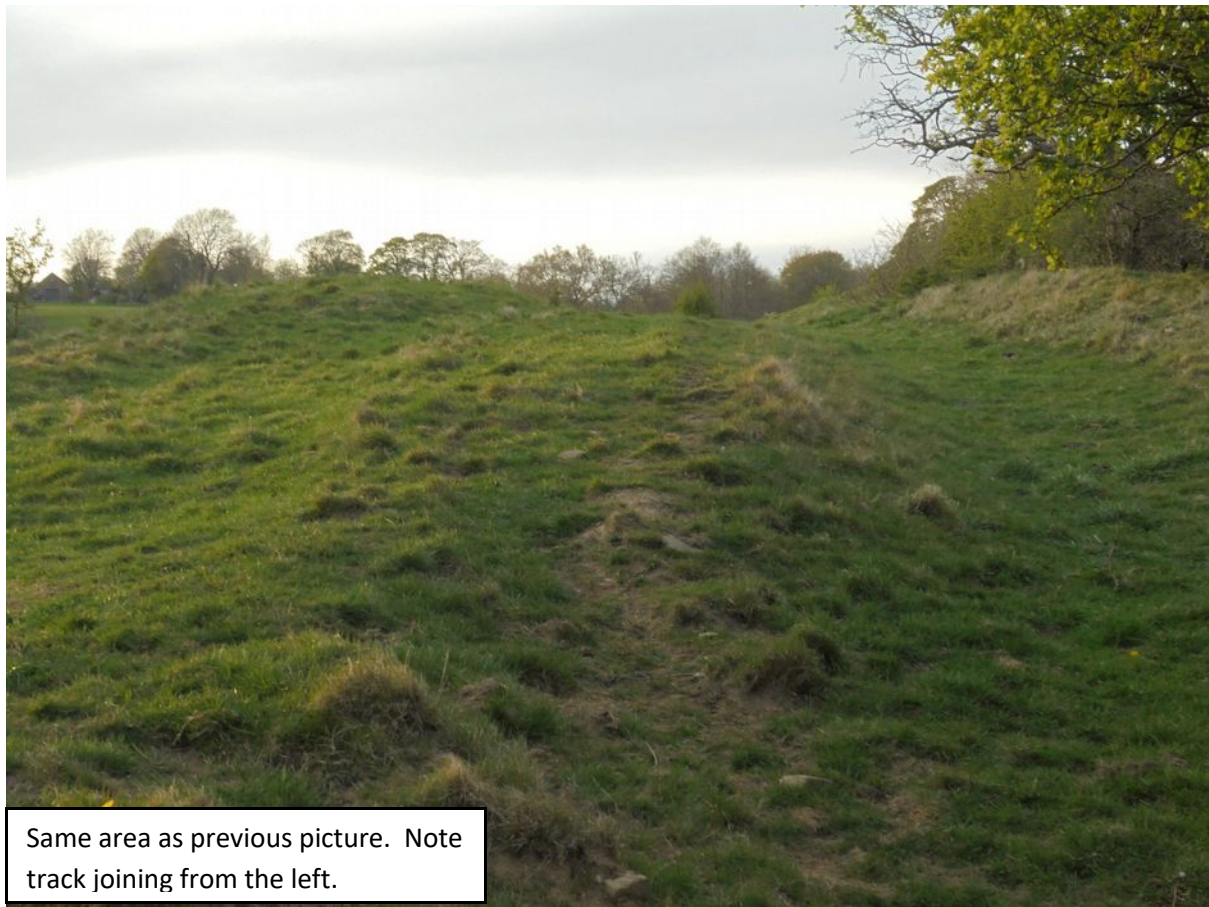
Same area as previous picture. Note track joining from the left.

There quite a few other tracks joining the main system, such as the one above. These peter out after a few metres and were probably intended to afford easy access to the main track for vehicles or larger animals. As far as could be seen, there is very little stone in the banks or ditch base in field 221. Further uphill a badger sett has undermined the bank, which has started to give way, revealing the composition is mainly coarse, sandy soil.