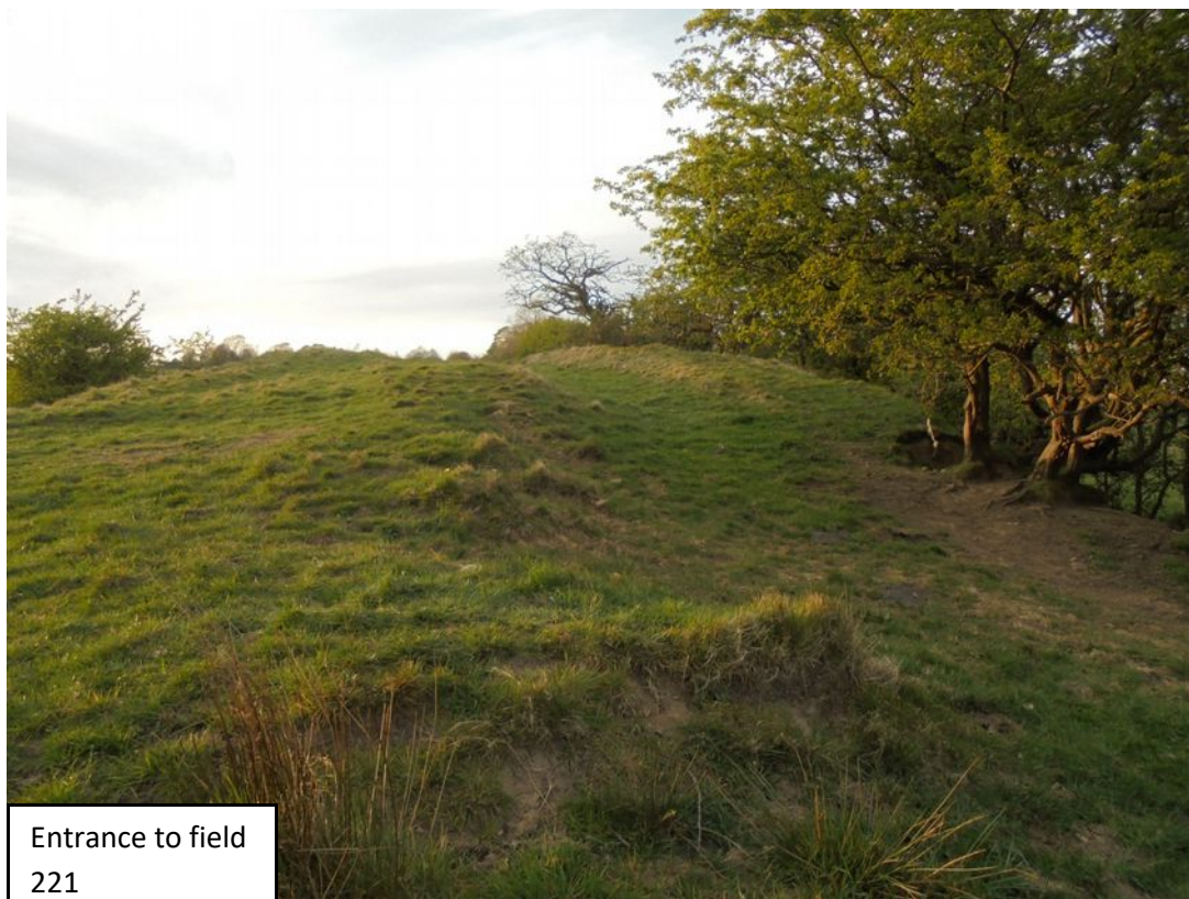
Entrance to field 221